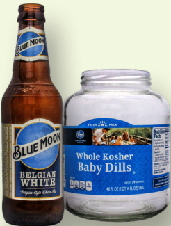
Bottles and Jars