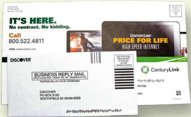
Mail and Magazines