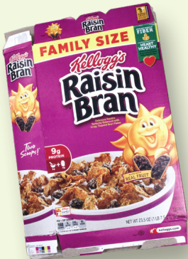
Paper and Frozen Food Boxes