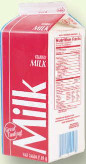
Milk and Juice Cartons